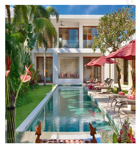
Next Door Villa