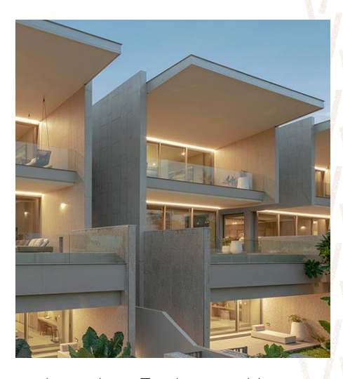
Less than 7 minutes drive

6 bedrooms Sleeps 12 adults www.baantaleyromphuket.com