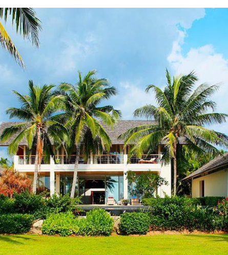
Less than 5 minutes drive