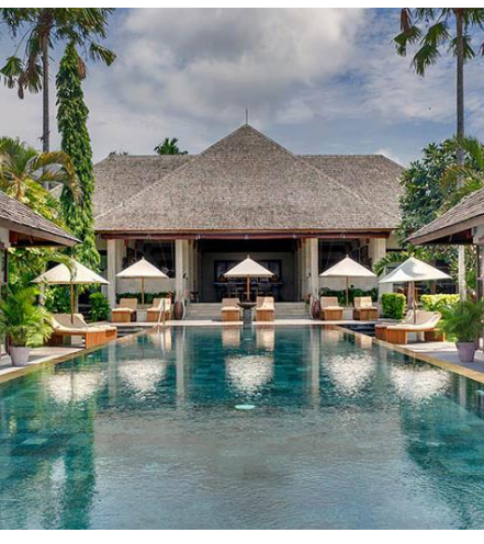
About 8 minutes drive

5 bedrooms Sleeps 10 adults www.villamaridadi.com