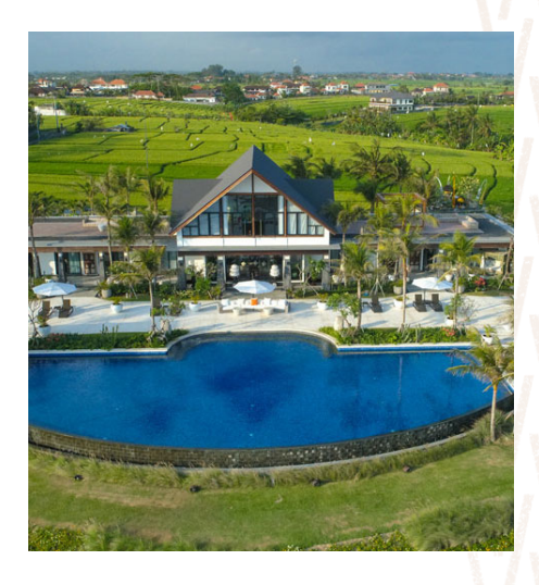
About 5 minutes drive

7 bedrooms Sleeps 14 adults www.villamandalaybali.com