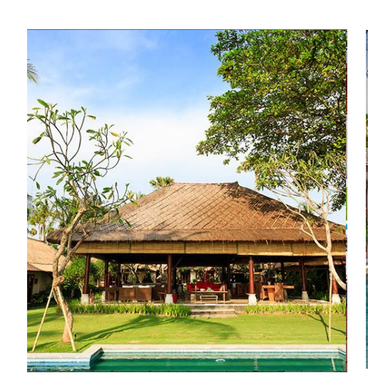
Less than 5 minutes walk