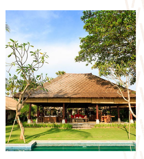
Less than 10 minutes drive or around 500 m distance

5 bedrooms Sleeps 10 adults www.semarapuravilla.com