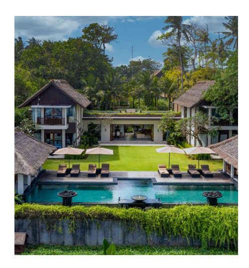
Less than 5 minutes drive or around 500 m distance