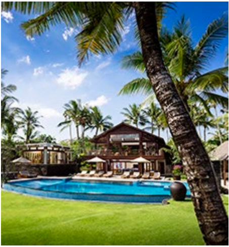
Less than 10 minutes drive or around 500 m distance

11 bedrooms Sleeps 22 adults www.sesehbeachvillas.com