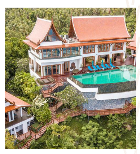
Around 33 minutes drive

10 bedrooms Sleeps 24 adults www.tawantokbeachvillas.com