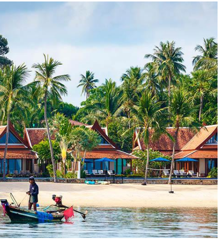
About 23 minutes drive

5 bedrooms Sleeps 10 adults www.villasilavaree.com