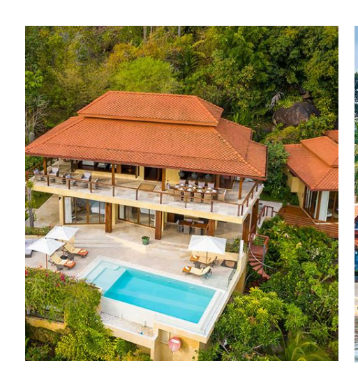
About 10 minutes drive