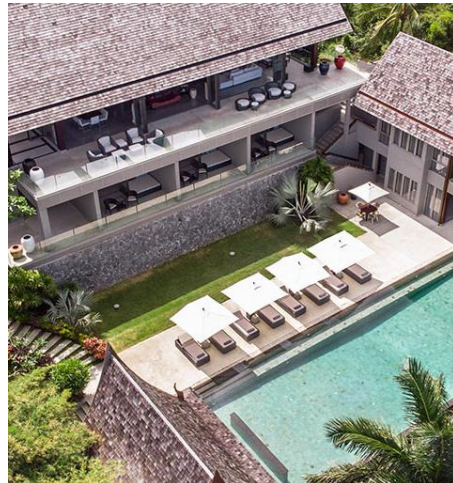
About 10 minutes drive Suralai

6 bedrooms Sleeps 12 adults www.panacearetreatsamui.com