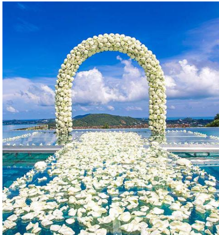
About 2 minutes walk Panacea Retreat – Praana Residence

6 bedrooms Sleeps 12 adults www.panacearetreatsamui.com