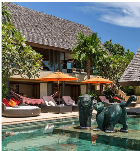
About 2 minutes walk Panacea Retreat – Purana Residence