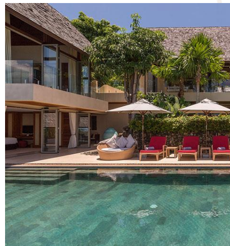
About 2 minutes walk Panacea Retreat – Avasara Residence