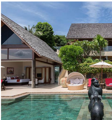
About 2 minutes walk Panacea Retreat – Kalya Residence