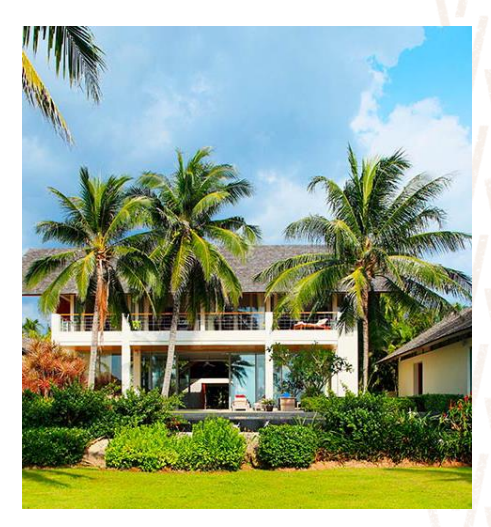
About 6 minutes drive