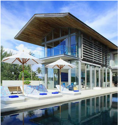
Around 10 minutes drive